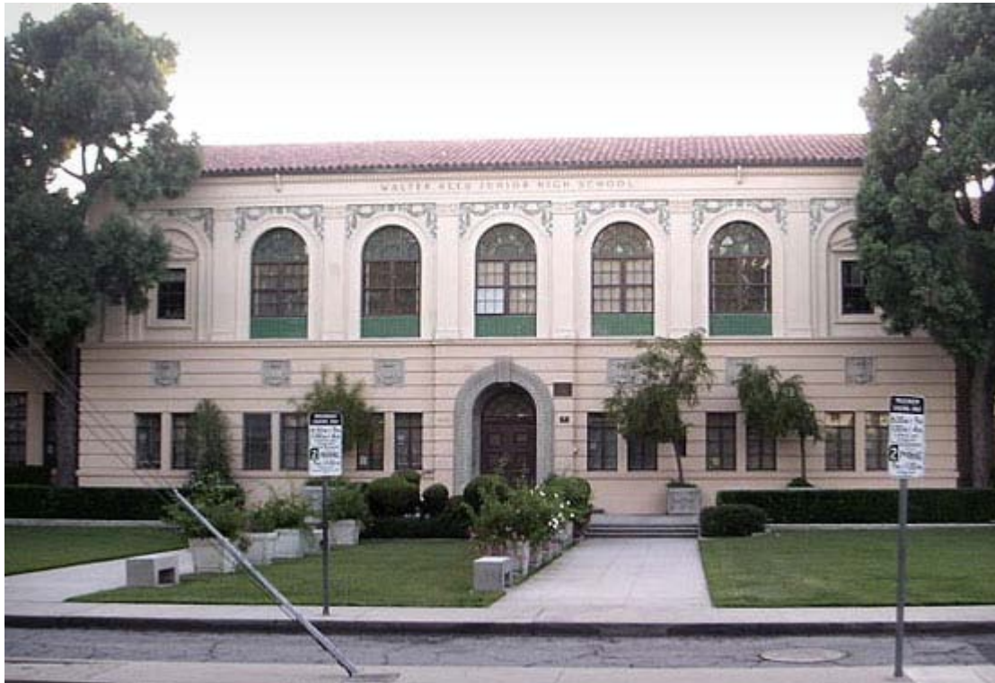
Walter Reed Middle School in Los Angeles

How Los Angeles undercut its pathbreaking IHP project